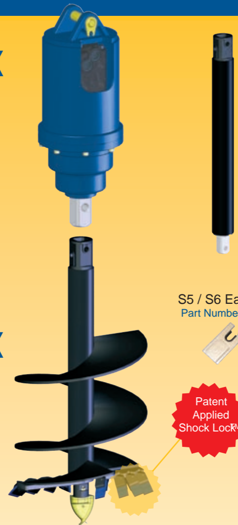
S5 / S6 Earth Tooth Part Number 33-9105